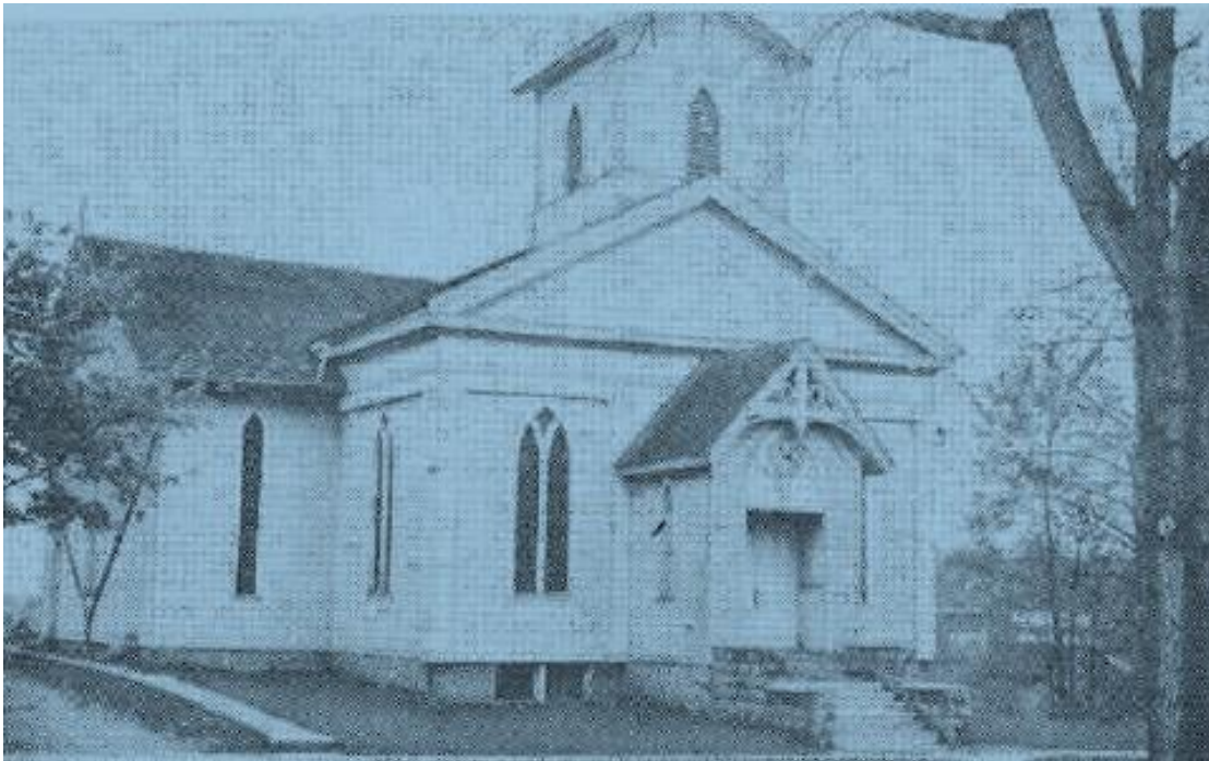
Present Baptist Church